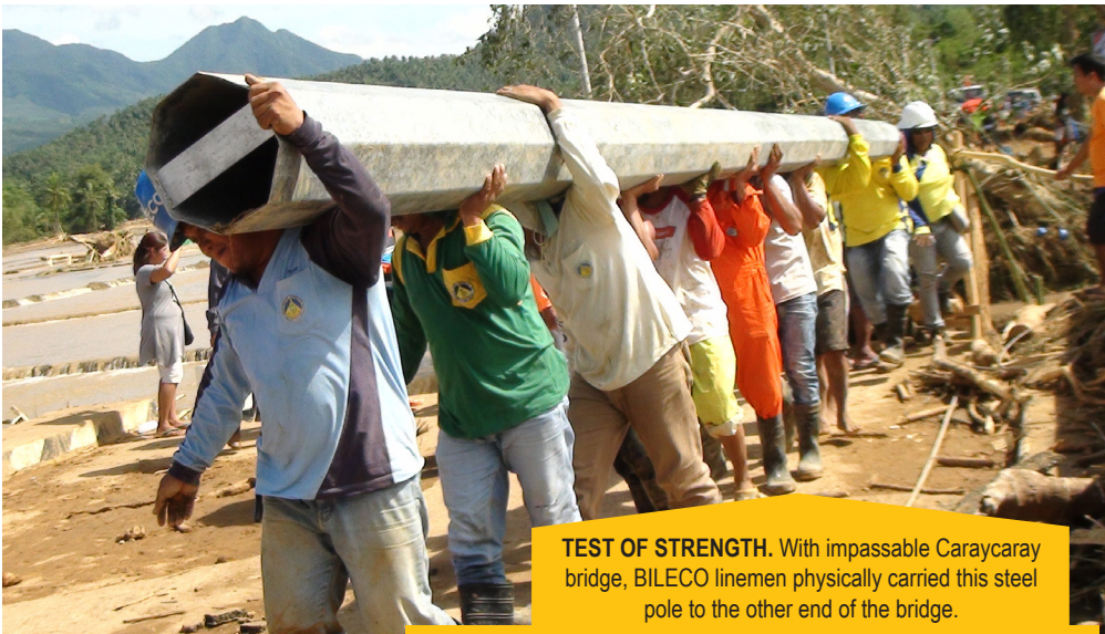
TEST OF STRENGTH. With impassable Caraycaray bridge, BILECO linemen physically carried this steel pole to the other end of the bridge.

The Official Newsletter of the Biliran Electric Cooperative, Inc. (BILECO)