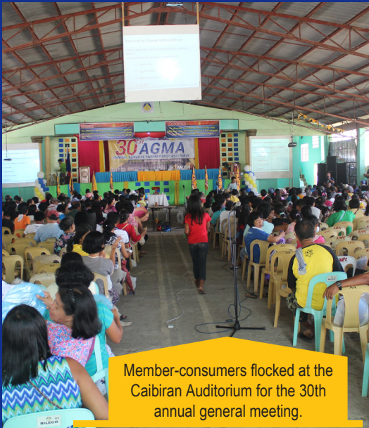
Member-consumers flocked at the Caibiran Auditorium for the 30th annual general meeting.