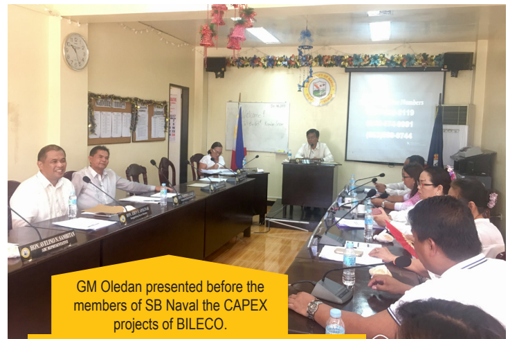
GM Oledan presented before the members of SB Naval the CAPEX projects of BILECO.

with the local government units and barangay officials were undertaken to seek support on the project especially on the right-of-way negotiation. A separate meeting with PENRO, DPWH and MPDC was also held to ascertain compliance on each agency's requisites.