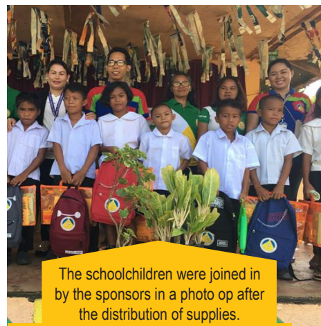
The schoolchildren were joined in by the sponsors in a photo op after the distribution of supplies.